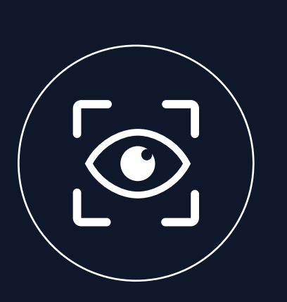
700 nits highlighting