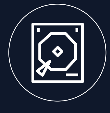
16GB RAM 128GB SSD